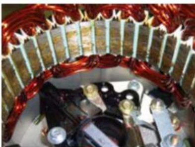
Inferior varnish process on O.E. alternator causes noisy operation & interference between internal stator & rotor components.