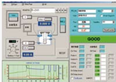
Final Computer Test Screen