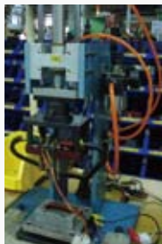
Final Production Line Tester

■ Comprehensive cataloging, including all performance, specification & cross reference data