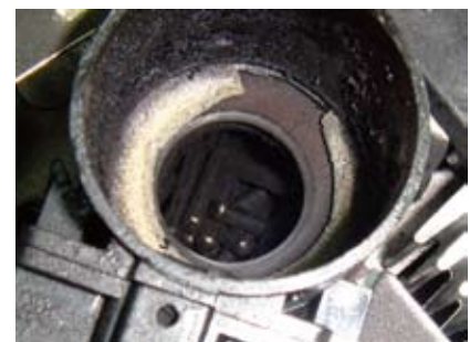
Collapsed OE needle bearing after critical speed durability test